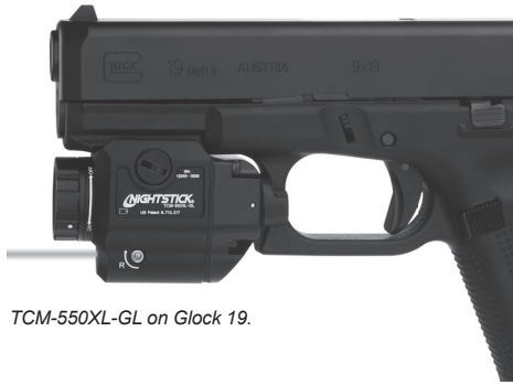
TCM-550XL-GL on Glock 19.